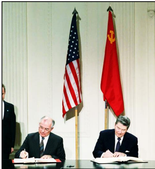
Figure I Gorbachev and Reagan sign the INF Treaty

At that time, governments worldwide were apprehensive with the possibility of a nuclear war between the two Superpowers. However, despite the fact that the nuclear arms race gave “an important contribution to tension between the [two] adversaries” (ARBATOV, 2006, p. 45), contrary to what many believed direct conflict between the US and the Soviet Union was in fact contained, once the threat of mutual assured annihilation (MAD) “stimulated both sides in [...] controlling the competition and in achieving a necessary degree of stability, order, and predictability in world politics” . (NOVIKOVA and BODROV, 2017, pp.83-84).